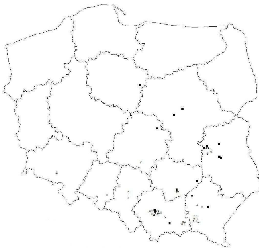
Figure 1. Location of specimens. * - plantations, ● - collections, ■ - nurseries, ▲ - urban greeneries, # - amateurish cottage plantations, ■ – allotments, ● - wild growing

The visual inspection of all tested plants was carried out during test period for the presence of any disease symptoms.